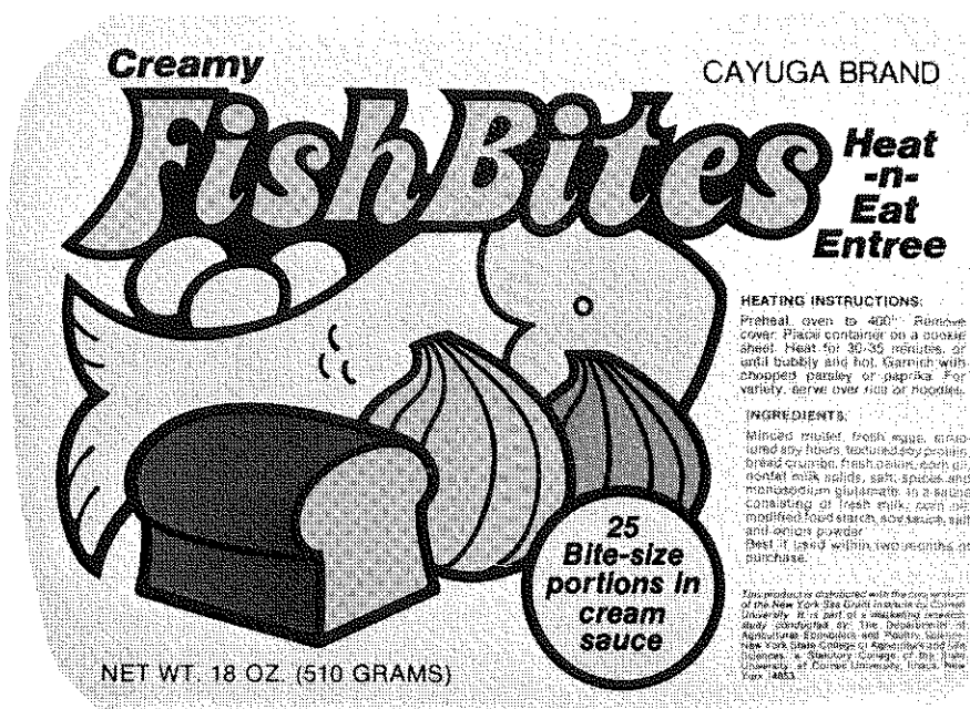
Figure 1. Cover for Cayuga Brand Creamy Fish Bites.