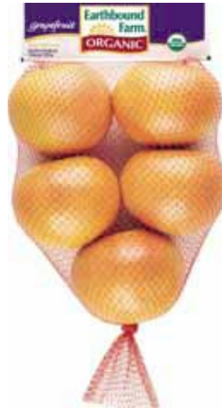
Produce Business May 2007 issue, p. 116 http://www.producebusiness.com/e-books/PB07MAY.pdf