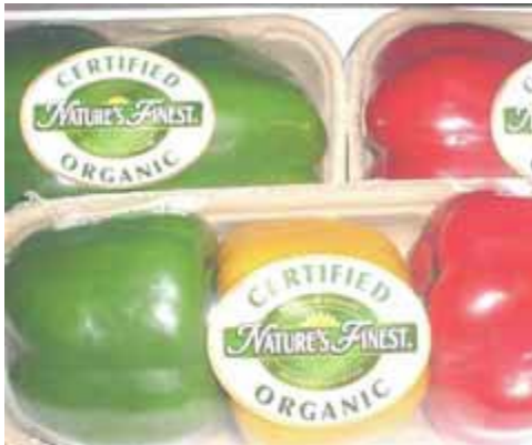
Produce Business May 2007 issue, p. 116 http://www.producebusiness.com/e-books/PB07MAY.pdf

Consumers of organic foods affirm they have better and richer flavor than their conventional counterparts