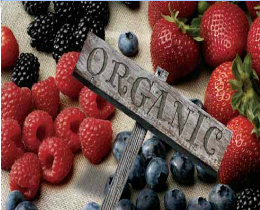
Produce Business, May 2007 issue p. 110 http://www.producebusiness.com/e-books/PB07MAY.pdf