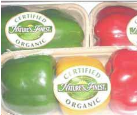
Produce Business May 2007 issue, p. 116 http://www.producebusiness.com/e-books/PB07MAY.pdf

Consumers of organic foods affirm they have better and richer flavor than their conventional counterparts