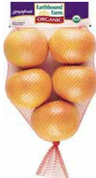
Produce Business May 2007 issue, p. 116 http://www.producebusiness.com/e-books/PB07MAY.pdf