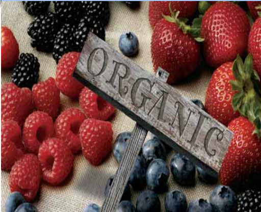
Produce Business, May 2007 issue p. 110 http://www.producebusiness.com/e-books/PB07MAY.pdf