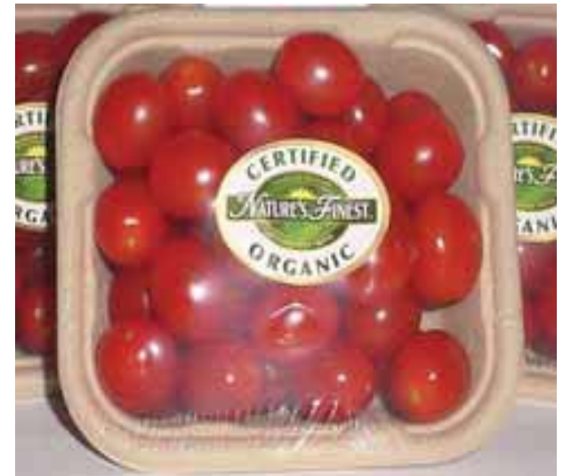
Produce Business May 2007 issue, p. 116 http://www.producebusiness.com/e-books/PB07MAY.pdf